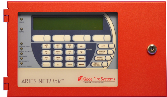
Figure 4. RDCM REMOTE DISPLAY CONTROL MODULE (RDCM) SPECIFICATION

RDCMs are user interfaces that replicate the ARIES NETLink and can be located remotely from the main enclosure so as to accomplish system control from multiple locations. RDCMs display all system events and allow full system control and operator intervention via an LCD display, keypad, buzzer, five (5) system status LEDs and four (4) user-programmable soft-keys. A synchronization signal output allows expansion of up to 15 RDCM units. RDCMs are wall mountable in their own discrete enclosures and operate on 24 VDC sourced from either the ARIES NETLink Auxiliary Power Output or listed external power supply.