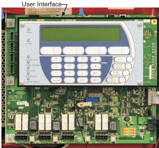
Figure 2. Main Controller Board and User Interface