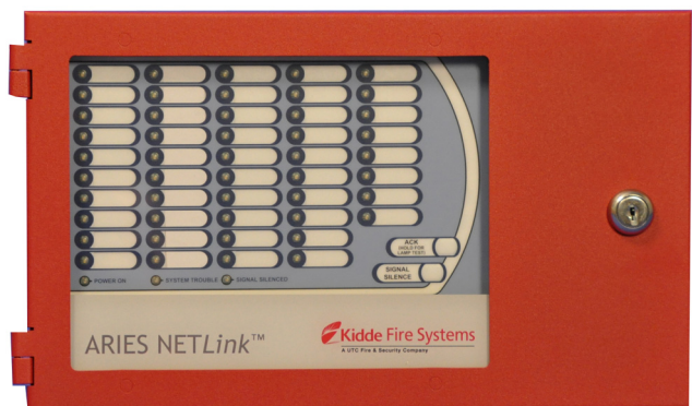
Figure 5. R-LAM

R-LAMs are annunciators that provide 48 independently programmable LEDs. Each LED is dual color (red and yellow) and has space available for an identification label. R-LAMs include three system-level LED outputs for Module Power, System Trouble and Signal Silenced. Also included are system-level input functional switches for Signal Silence and System Acknowledge/Self-Test commands. R-LAMs are mounted remotely from the main enclosure and utilize the same remote enclosures as do RDCMs. LED Annunciator Modules can also be mounted within the main ARIES NETLink enclosure for ULC/cUL applications.